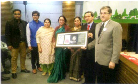
Felicitation Ceremony for being a part of the World Record

After the world's largest science experiment, 100 students from Classes VI-VIII made it to the prestigious Guinness Book of World Records by participating in the World's Largest Air Pollution Awareness Programme. The programme witnessed one-of-its-kind activity where Lung Care Foundation brought forward over 5100 school children from over 35 schools from Delhi-NCR to form the largest human image of an organ (Lung). The objective was to create awareness about ill-effects of pollution on Lung Health and motivate individuals to People-driven Solutions.