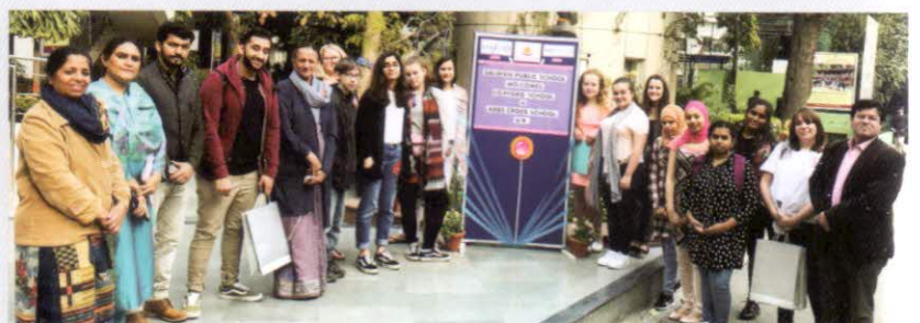
Strengthening our Bonds