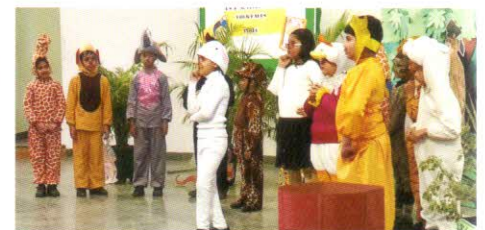
Learning from the World of Animals