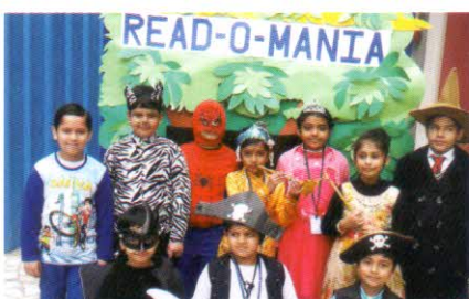
Students dressed as their favourite characters