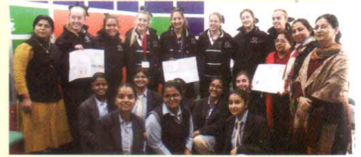
We Share, We Learn, We Grow