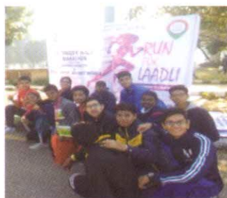
United for a Cause

Twenty students from the school participated in A Unique Half Marathon Run for Laadli on 17th December 2017 organised by Delhi Police & Laadli Foundation. The event was held around JLN Stadium to spread awareness towards gender equality and to stop crimes against women.