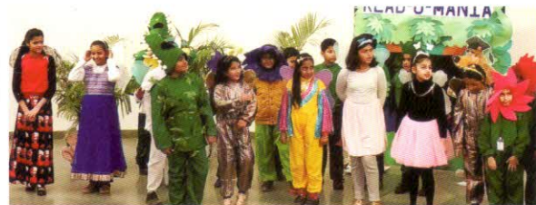
Listening to the Resource Person with rapt attention