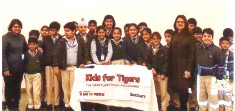
We are the harbingers of change!

The students of Classes IV and V attended an Audio-Visual Show conducted by a resource-person from 'Kids for Tigers' on 19th December, 2017 in the Amphitheatre. The session emphasized on the urgent need to spread awareness on forest conservation and wildlife protection. The students were sensitized about the fact that disturbing the harmony in nature will eventually have many adverse effects on our lives.