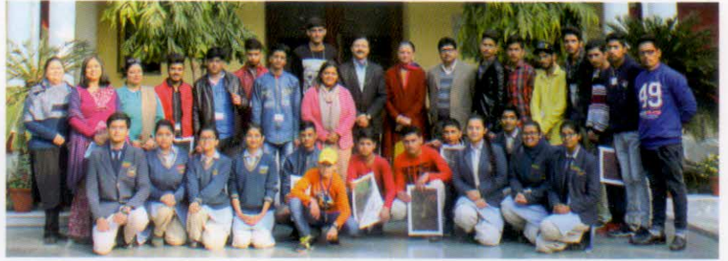
Unity in Diversity