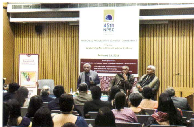
Eminent Panelists sharing their thoughts with the audience

focus on blending of life skills, knowledge and expertise in a safe and happy environment. In this age of aggression, focus should be on developing critical thinking, empathy and respect for each other.