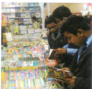
Relishing the World of Books