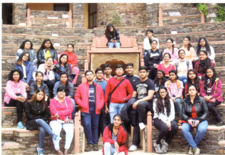
Imbibing the lesson of Collaborative Learning

Development Programme scheduled at NIIT campus in Neemrana, Rajasthan from 11 th – 15 th December, 2017.