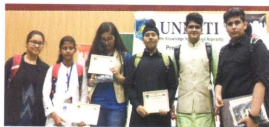
Sharpening their Debating Skills

Five students from Classes IX and X from SPS (Morning and Afternoon) participated in Uthan Youth Parliament on 20 th & 21 st January, 2018 at Faculty of Social Sciences, Delhi University. The students debated on issues like Reforms in the Censorship Laws, Gujrat Riots and Right to Privacy. They got an exposure to contemporary political issues and proposed solutions to the problems faced by the country.