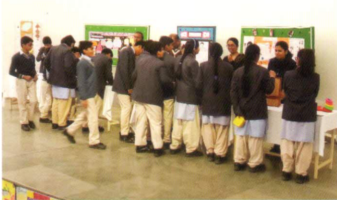
Maths is fun!

To commemorate the birth anniversary of great Indian Mathematician, Shri Srinivasan Ramanujan, the students under the guidance of Maths Faculty celebrated Ramanujan Week from 18th December to 22nd December 2017. A number of activities, viz. Solving Sudoku Puzzles, Mathematical Rangoli Competition and Poster Making Competition were organised.