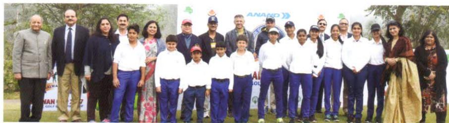
Salwan Education Trust: Creating a Culture of Sports