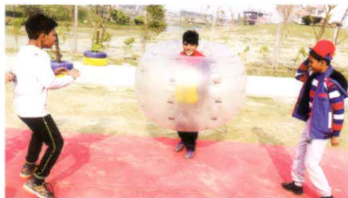
Zorbing is Fun!

Muddy Boots Adventure Camp was organized for the students of Classes I-V at Noida on 26 th December, 2018. The enthusiastic children loved participating in physical activities and outdoor sports such as Zip line, Commando net, Hopscotch, Vertical ladder, Commando crawl,