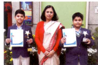
Young Achievers with their Mentor

Digital Citizenship and Cyber Wellness Online Olympiad was organized in the school by the Ministry of Electronics and Information Technology and Learning Links Foundation on 27 th October, 2017. The Olympiad aimed at generating awareness on using the internet resources safely and responsibly for building a Safe Web Environment by nurturing responsible Netizens. 24 students appeared for the DCCW Online Quiz. The quiz witnessed participation of students from all across the globe.