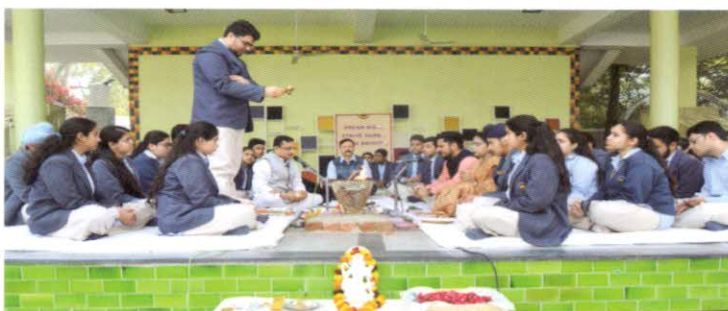
Seeking the blessings of the Almighty