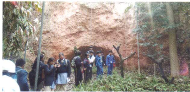
Conservation for a Brighter Future

On 3rd February 2018, four students from SPS-Morning and two from SPS Afternoon joined the Nature's Trail organized by Kids for Tigers at Aravali Biodiversity Park, Vasant Vihar along with the teacher coordinator. The programme began with a short documentary on Aravali Biodiversity Park.