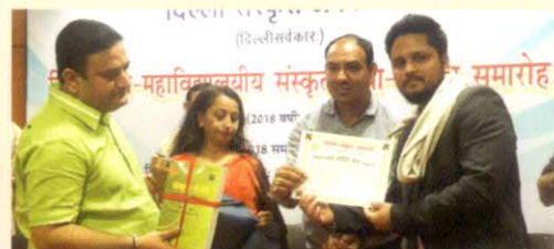
Teachers being felicitated by Sanskrit Academy