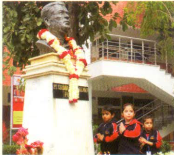
A Beacon of Light: Our Founder Father