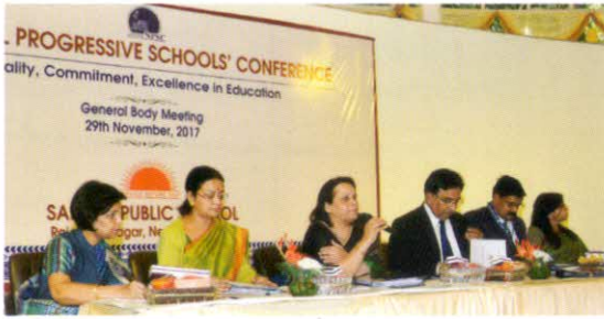
Our Esteemed Guests in Panel Discussion

The school organised the General Body Meeting of the National Progressive Schools' Conference on 29 th November, 2017. The National Progressive Schools' Conference is a 44 year old association initiated in 1973. The meeting was attended by Life, Honorary and Executive Members. The programme began with an invocation dance followed by a documentary on Salwan Schools.