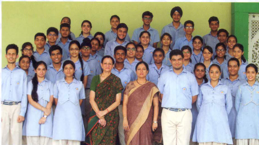
Student Council SPS Morning