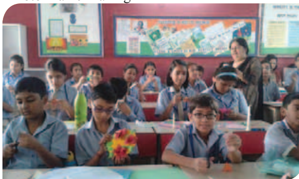
Decorative Items for Diwali