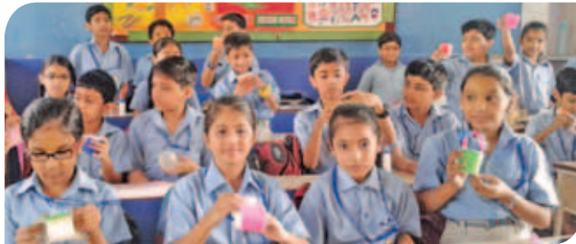
Photo Frame Making